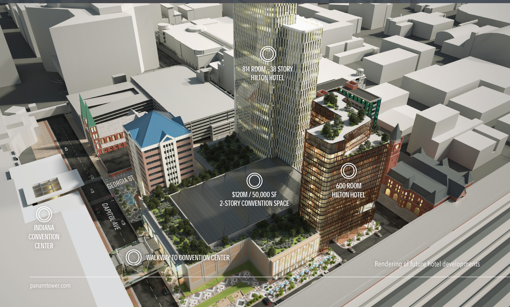
Rendering of future hotel developments